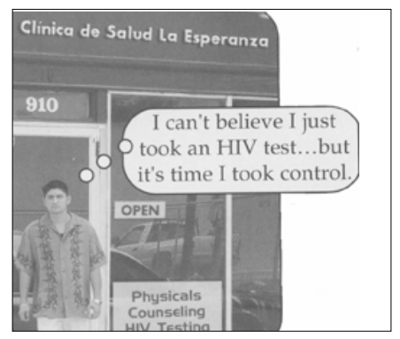
Scene from fotonovela Rude Awakening / Un Cruel Despertar

In creating these fotonovelas, FJF promotores took pains to ensure that they were culturally and linguistically