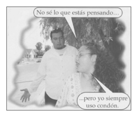
Scene from fotonovela The Gift of a Lifetime/ El Regalo de Toda Una Vida

appropriate, easy to read with visual appeal, and had a clear educational message. The stories touch on issues such as substance abuse, condom use, fear of disclosing same sex orientation, and stigma. Their prevention message are aimed at both individuals who are HIV infected and uninfected.