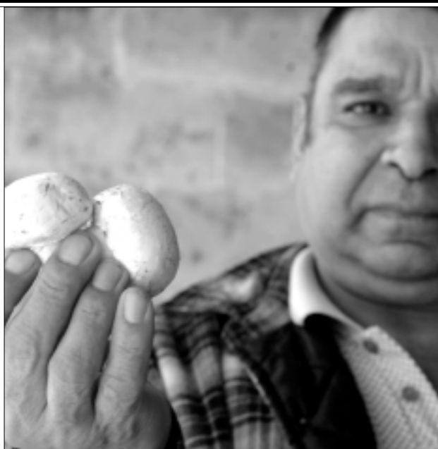
Pennsylvania mushroom worker and union organizer.

Thank you for helping us build Farmworker Justice.