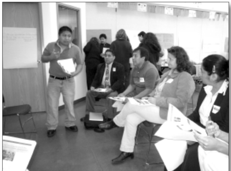
Group discussion during the Farmworker Health Forum in Woodburn, OR

This forum was a collaborative effort of Farmworker Justice, the Oregon Law Center, Cascade AIDS Project, Tuality Community Hospital, Portland Community College, Virginia Garcia Memorial Health Center and Salud Medical Center, made possible with funding from the Office of Minority Health/AIDS. •