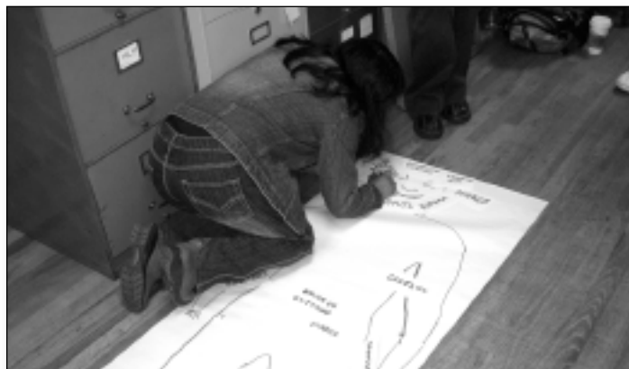
Participant in environmental health training session for promotores de salud program in Woodburn, OR

In the fourth and final year of the project, we will evaluate the results of the program to determine what was learned, what worked, and what needs to be changed to improve the efficacy of the program for future implementation. •