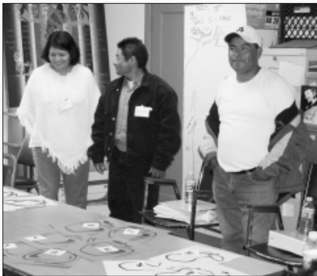
Promotores practice pesticide safety education training for indigenous farmworkers in Oregon

Farmworker Justice News , available at www.farmworker-justice.org – click on “Resources.”) This information was used to develop and implement a culturally and linguistically appropriate promotores de salud program to disseminate occupational health and safety information.