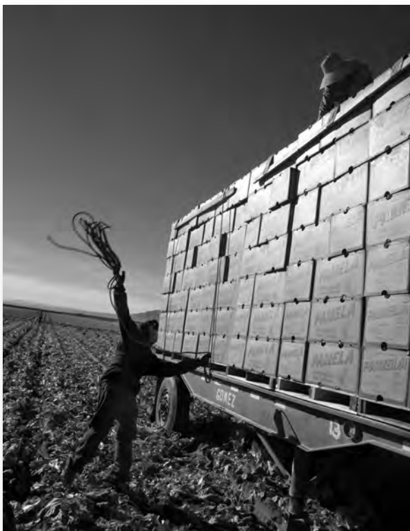
Loading boxes of lettuce after the field has been harvested.

I started working the lettuce harvest, and did that for ten years. The lettuce crop is a longer harvest, about six or seven months, so then I didn't work for the other five months. I did it for ten years and then I was done. The harvesting begins at night, so I started my shift at three in the morning, which means I had to leave my house at two. That is what the company required -- begin work at three and go until you're done. We worked in the dark, but there was a light on the machine so that we could see. We worked ten hours, until one in the afternoon. But there were times they made us work twelve hours, which meant we didn't finish until three in the afternoon.