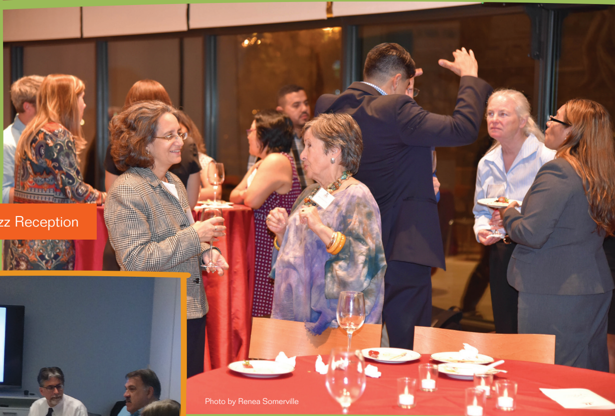
2017 Wine and Jazz Reception