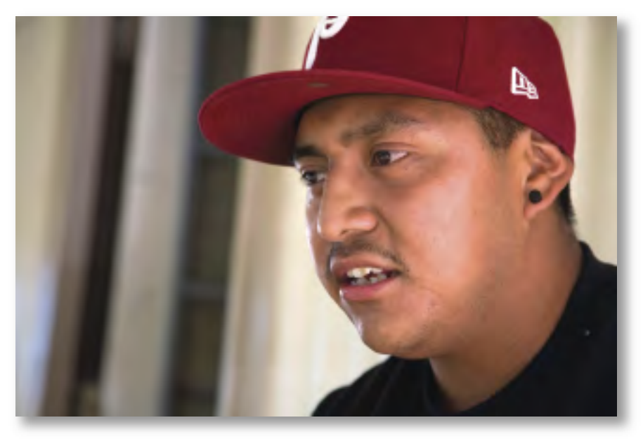
But then you need the money. So the next morning you talk yourself into going back out, even though it hurts. You do it because you have to.

I have worked every crop I could get work in. The hardest thing about the grapes is the heat. Sometimes it's so hot I get dizzy. When you try to get away from it, and go into the shade under the vines, the little flies or gnats come swarming at you. They get onto your skin and hair, and even fly into your nose and mouth. Picking strawberries is really hard too. Your back and knees hurt a lot, because you have to work bent over so much. The first day you're out there you can hardly get through it. When you get home you say to yourself you'll never go back.