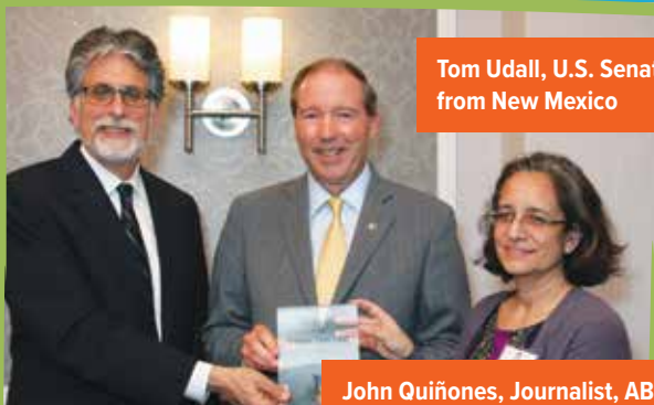
Tom Udall, U.S. Senator from New Mexico