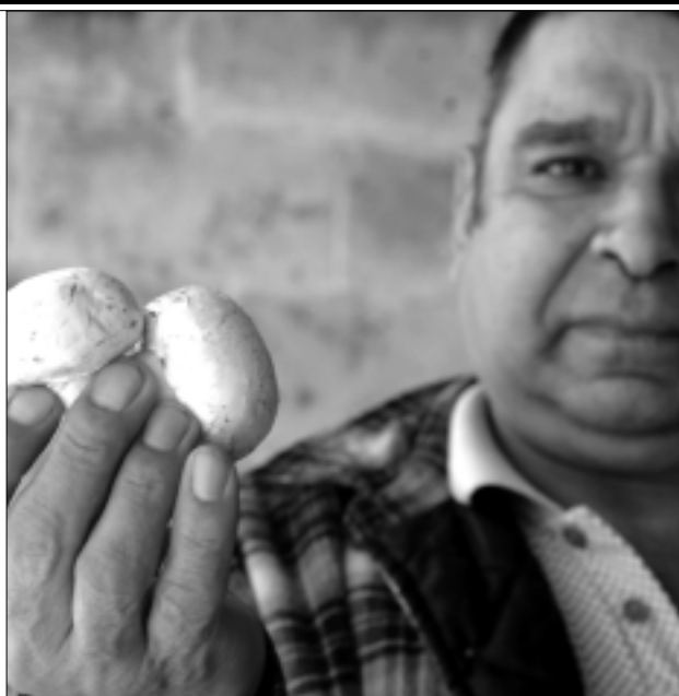
Pennsylvania mushroom worker and union organizer.

Thank you for helping us build Farmworker Justice.